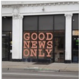
Gallery exterior.