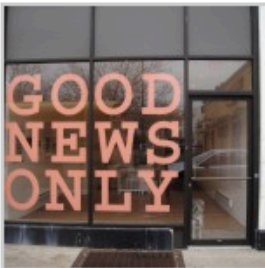
Good News Only.

The hours of the gallery are 1pm – 6pm, Tuesday through Friday and by appointment on the weekends. For more info, visit: http://gnonly.com/about.html